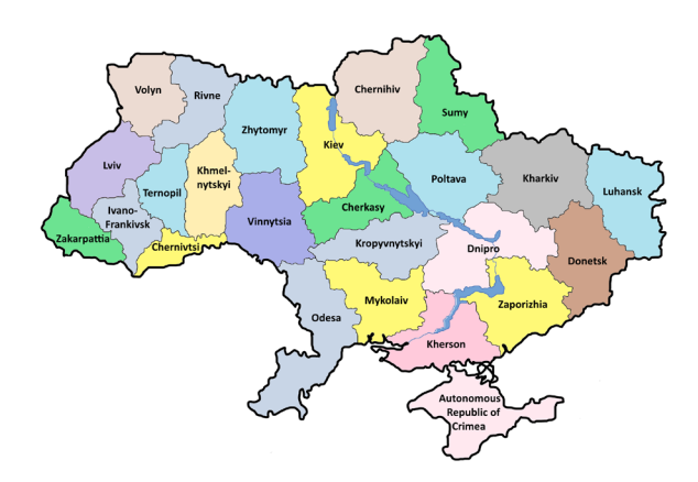
Fig. 1. Division of Ukraine into districts

Ukraine is divided into 24 regions (oblasts) and the Autonomous Republic of Crimea. The size of the country amounts to 60,362,800 hectares. Agricultural lands occupy 41.5 million hectares (or 68.7% of the entire country). Arable lands cover 32.5 million hectares or 78.4% of all agricultural lands. Compared to other European conditions, Ukraine agricultural land use amounts to approximately 19% and Ukrainian arable lands – approximately 27%. The same factor does not exceed 35% in developed European countries (ploughed areas) (Fig. 1) [2].