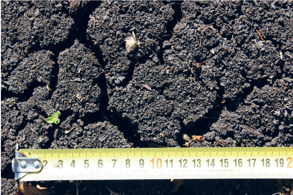
Fig. 2. Surface layer of studied fen several weeks into its drainage

The hydrogenic habitats degradation, caused by their drainage, progresses very fast. Already after several weeks from the lowering of the groundwater level, soils of mountain fen under Caltho-Alnetum community, show changes in their structure. While drying, the dewatered amorphous organic mass shrinks and cracks which damages plant root systems (Fig. 2).